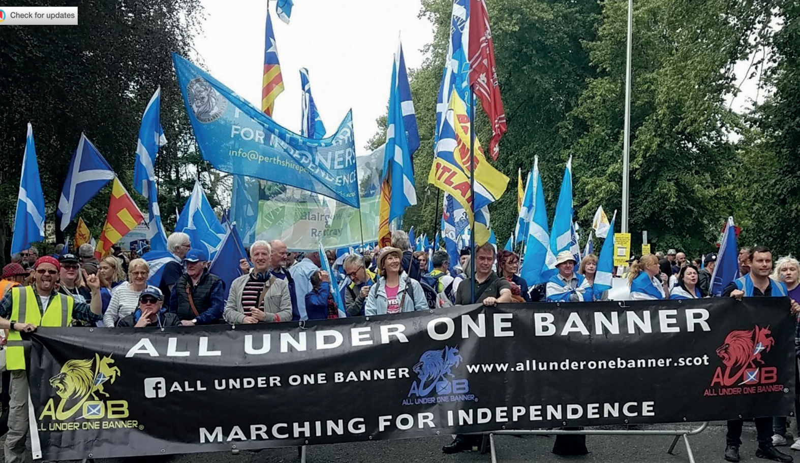
Aberdeen, 17 August 2019.