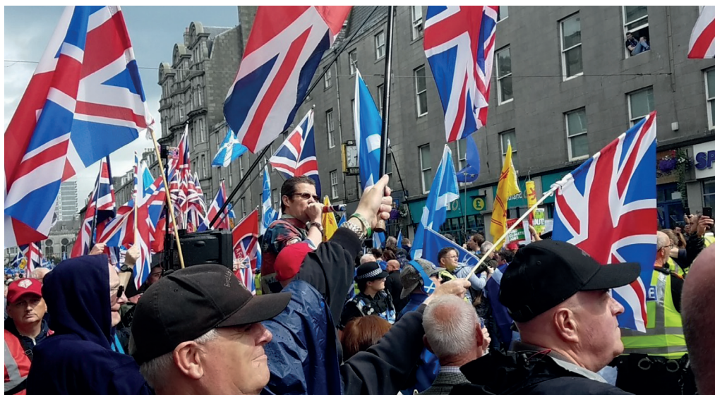
Aberdeen, 17 August 2019.

Marches in Edinburgh and Glasgow may be impressive, but still largely 'out of sight, out of mind' for the rest of the UK. Some activists in the movement may be loathe to take this approach from their belief that it surrenders the moral high ground. But the realpolitik of this situation clearly calls for some tactics of this nature.