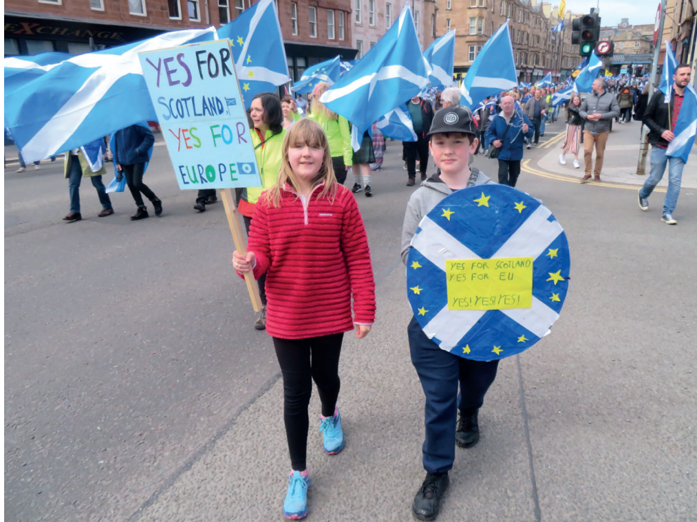
Glasgow, 4 May 2019.

Third, the independence movement might bring some actions directly to London.