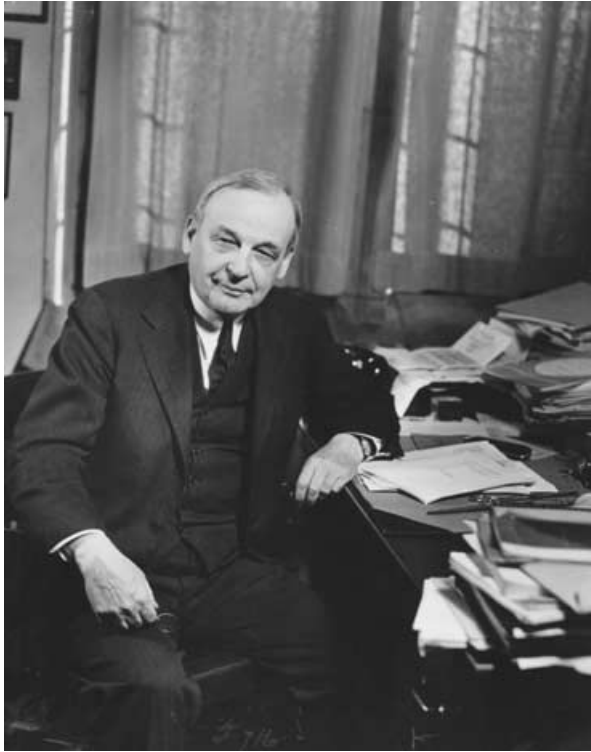
FIGURE 2. Charles E. Merriam